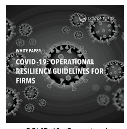
COVID-19: Operational Resiliency Guidelines for Firms