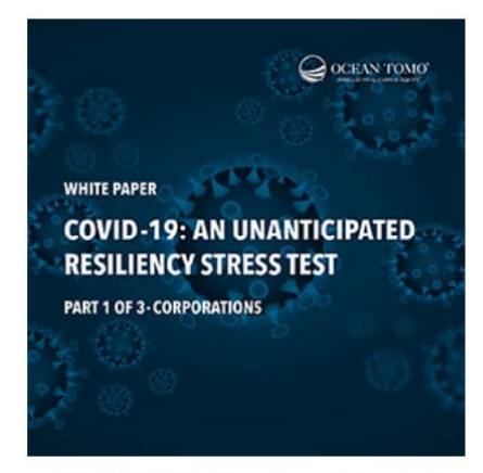
COVID-19: An Unanticipated Resiliency Stress Test -Corporations (Part 1 of 3)

Along with reviewing the looming challenges and risks during this period of uncertainty, we will highlight how organizations can proactively manage their impact, with responsive practices to strengthen business resiliency.